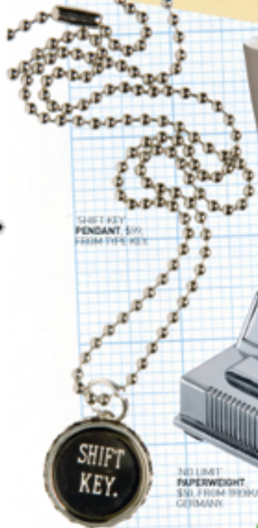
SHIFT KEY PENDANT, $39 FROM THE KEY