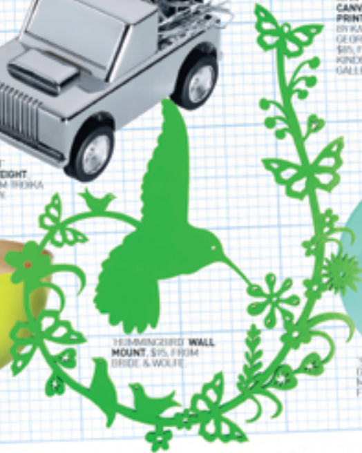
HUMMINGBIRD WALL MOUNT, $15 FROM ORIE & WOLFE