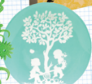
SEA-SAVY COUPE PLATE IN TEAL FROM THE CHILDHOOD MEMORIES COLLECTION, $7.95 FROM MAXWELL & WILLIAMS