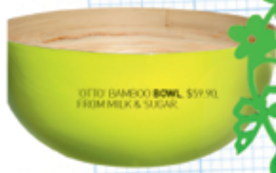
YUJO ISAMEKO BOWL, $39.95 FROM MILK & SUGAR