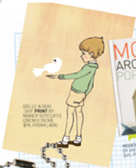
BELLE & BOO SHY PRINT BY MANDY SUTCLIFFE DZM KOSCHM $18 FROM LANK