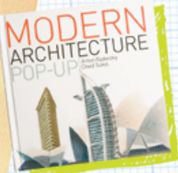
MODERN ARCHITECTURE POP-UP BOOK BY ANTON RADYVOKY AND DREW SOYOK $45 FROM RANDOM HOUSE