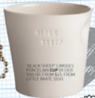
BLACK SHEEP LIMOGES PORCELAIN CUP BY DEB TAYLOR FROM $45 FROM LITTLE WHITE DISH